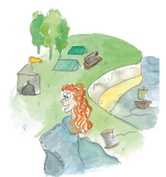
Meaning and Purpose